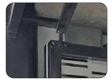
FLEX GUIDE™ System