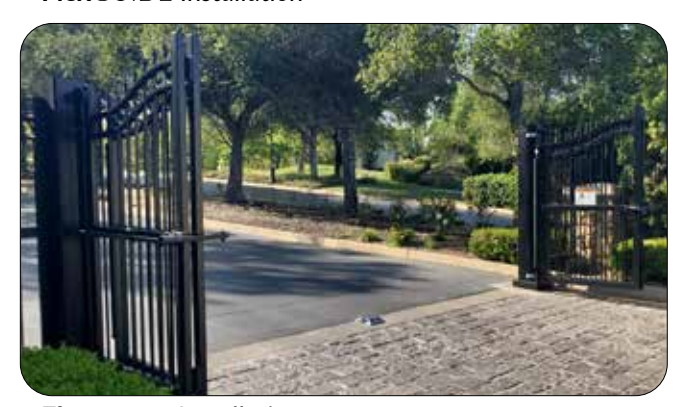
Flex ARM™ Installation