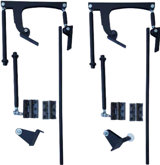
Model 3 kit